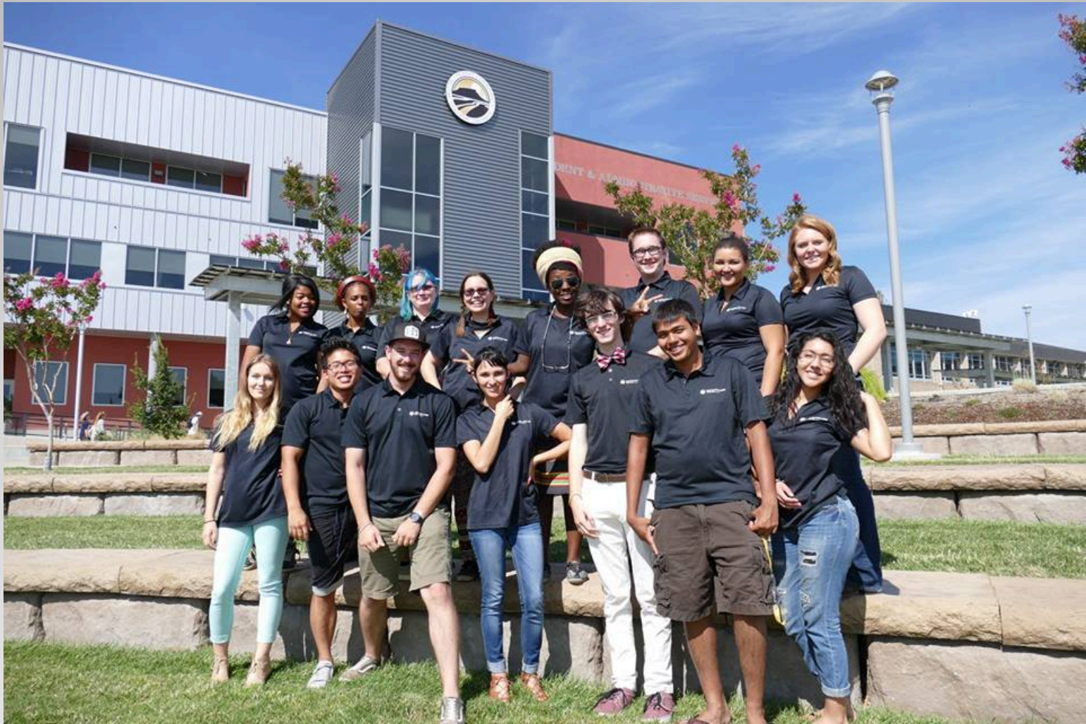
2015-2016 AS Officers